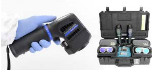
Powerful forensic LASER illumination / best-in-class Crime-lite technology

Detect and examine every last trace of evidence using intense, ultra-narrowband LASER illumination from a truly portable light source.