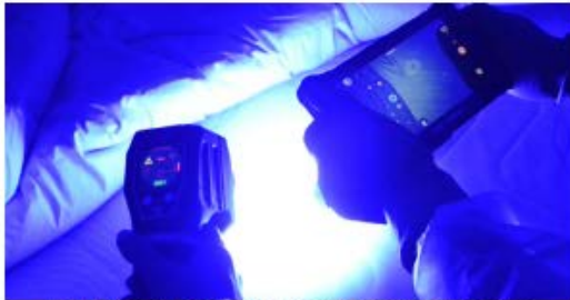
Using the Blue LASER to detect body fluids at the crime scene